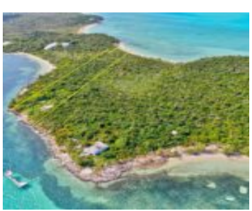
This 3.32+ Acres on Lubber's Quarters known as 'Moonrise Southern Acreage', boasts some of the most spectacular views. Sunrises overlooking the Atlantic and world renown Tahiti Beach, sunsets in the west off your sandy beach shore, and every tranquil moment in between. This parcel offers 150' of Eastern shore and 138' of sandy beach on [...]