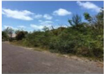
Aerial: Subject Property

This beautiful single-family lot located in Gated Community off Bacardi Road. Developed and quiet community with waterfront access! This is a 10,248 square foot lot in an upscale community. This lot is protected by 24-hour security with tennis court and outdoor pool and is located near the airport, beaches, doctors, eateries and food stores.