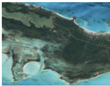
WITH VIEW OF CARIBBEAN SEA, CREEK & ATLANTIC OCEAN