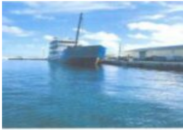
DRIGGS HILL MAIN DOCK NEARBY