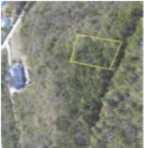
Front View with location approximation